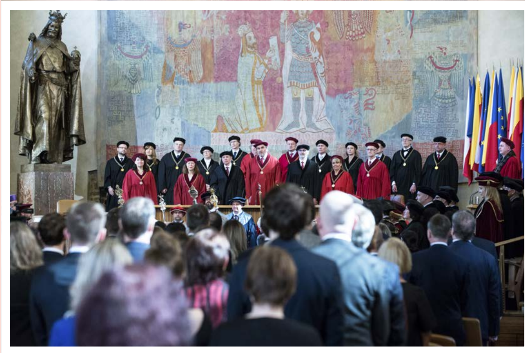
A total of five prominent Charles University researchers received the Donatio Universitatis Carolinae award in April 2019 at a ceremony commemorating the 671 st anniversary of the founding of Charles University.