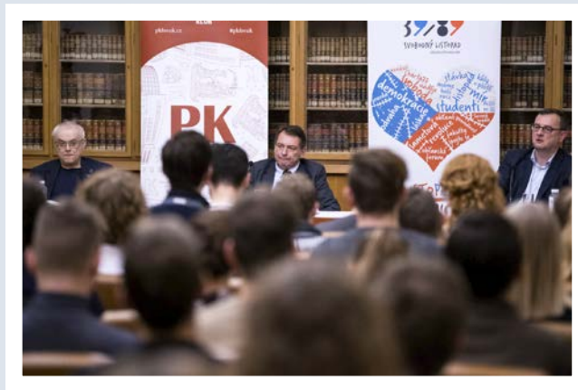
On 12 November 2019, the Political Science Club of the Faculty of Social Sciences of Charles University organised a debate entitled "Three Decades of Democracy: Debate between former Czech Prime Ministers". Former Prime Ministers Vladimír Špidla, Jiří Paroubek and Petr Nečas took part in the discussion.