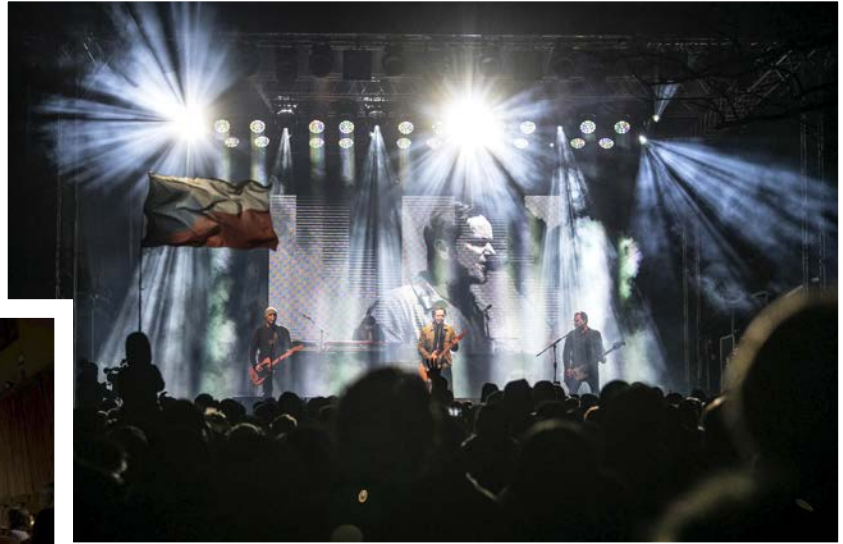
On 16 November 2019, the Free November student initiative organised a concert entitled "Velvet Eve" at Albertov in Prague.