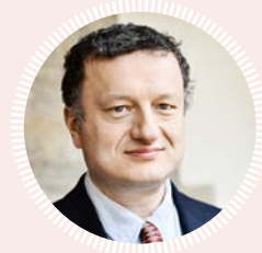
Vice-Rector for Research