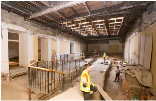
The oldest part of the Millesim Palace, a Romanesque house under the west wing, dates from the 12th century. Charles University has owned the premises since 1990.