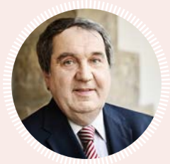
Vice-Rector for Development