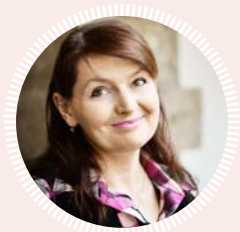
Vice-Rector for Education