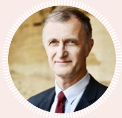
Vice-Rector for International Affairs