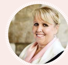
Vice-Rector for Conception and Quality of Education