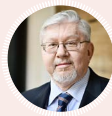
Vice-Rector for Academic Appointments