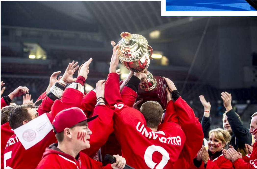
Charles University defeated the University of Economics 4:0 in the final of the Hockey Battle tournament. The CU hockey players won the cup for the seventh time!