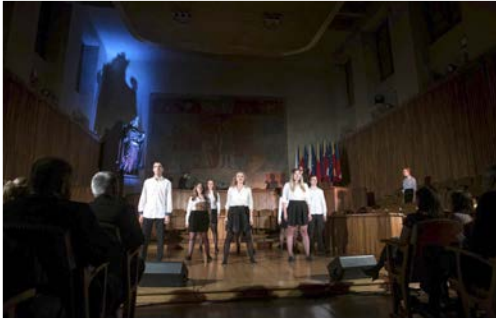
On 15 November 2019, the Great Hall in the Carolinum hosted the premiere of a musical for the first time in its history. It featured the theatrical piece The Unknown Soldier, prepared by students of the Faculty of Education of Charles University. The work was loosely inspired by the life of Karel Kryl.