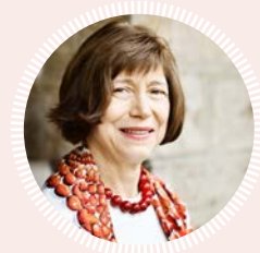
Vice-Rector for European Affairs