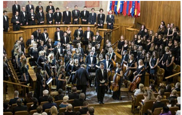
On the evening of 17 November 2019 a gala concert was held at the Carolinum on the occasion of the 80th and 30th anniversary of the events in November.