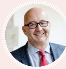
Vice-Rector for Public Affairs