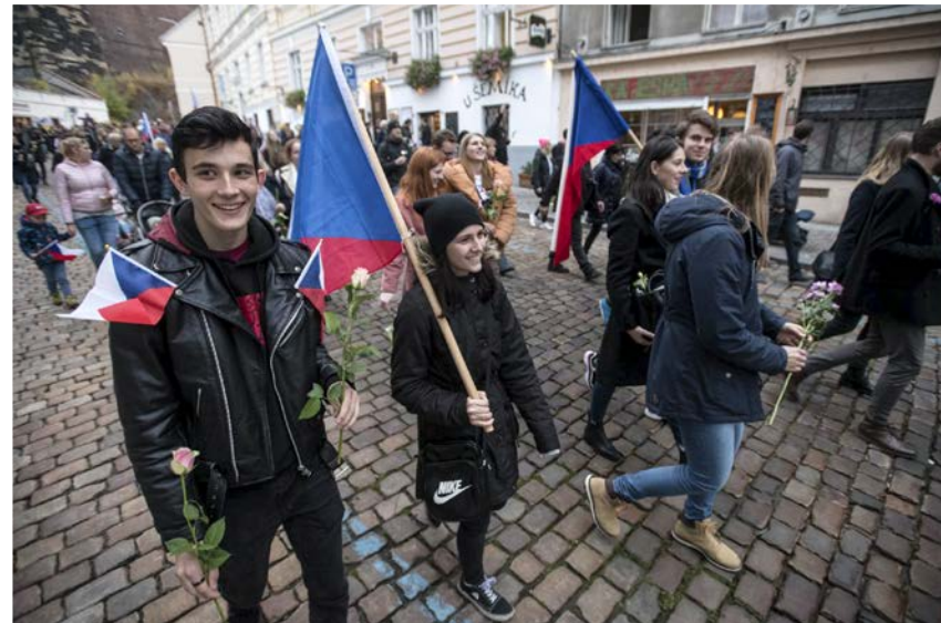
Hundreds of people took part in a procession which, as in 1989, headed from Albertov to Národní třída.

How will universities change in the next 30 years?