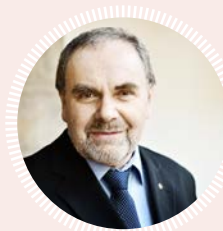
Vice-Rector for Projects and Publishing