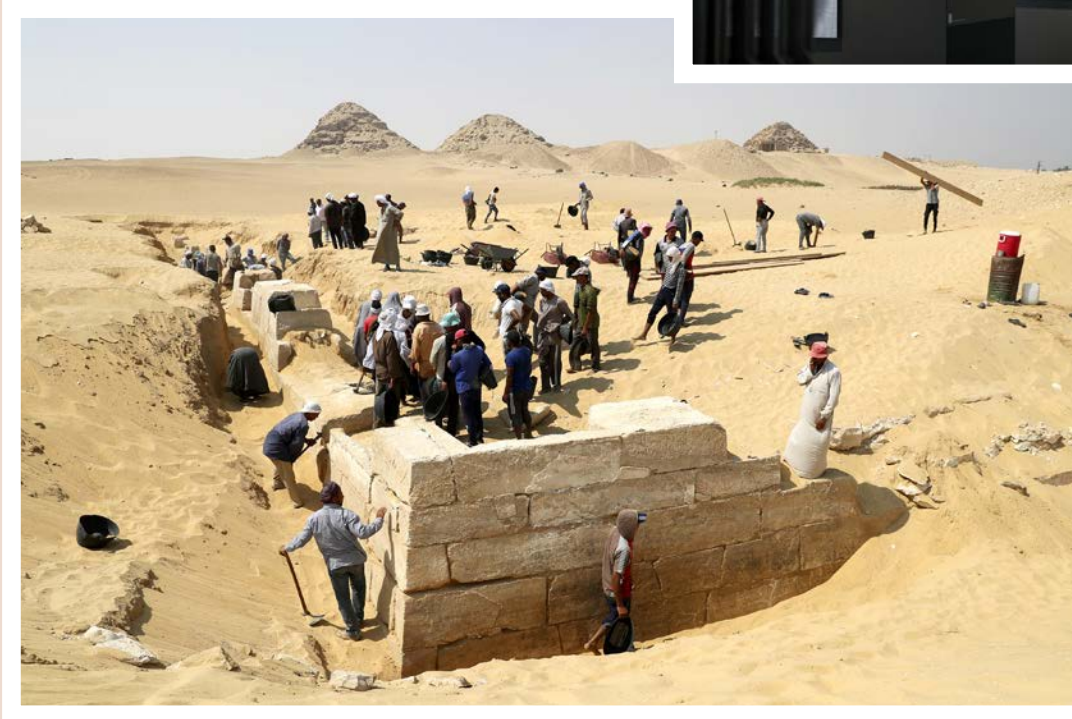
In 2019, Czech Egyptologists worked, for example, on the valley temple of Pharaoh Nyuserre. The picture shows a view of the southeast corner of the massive wall adjacent to the masonry of the temple.