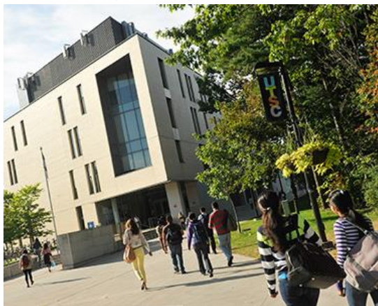
Figure 3 University of Toronto Scarborough campus