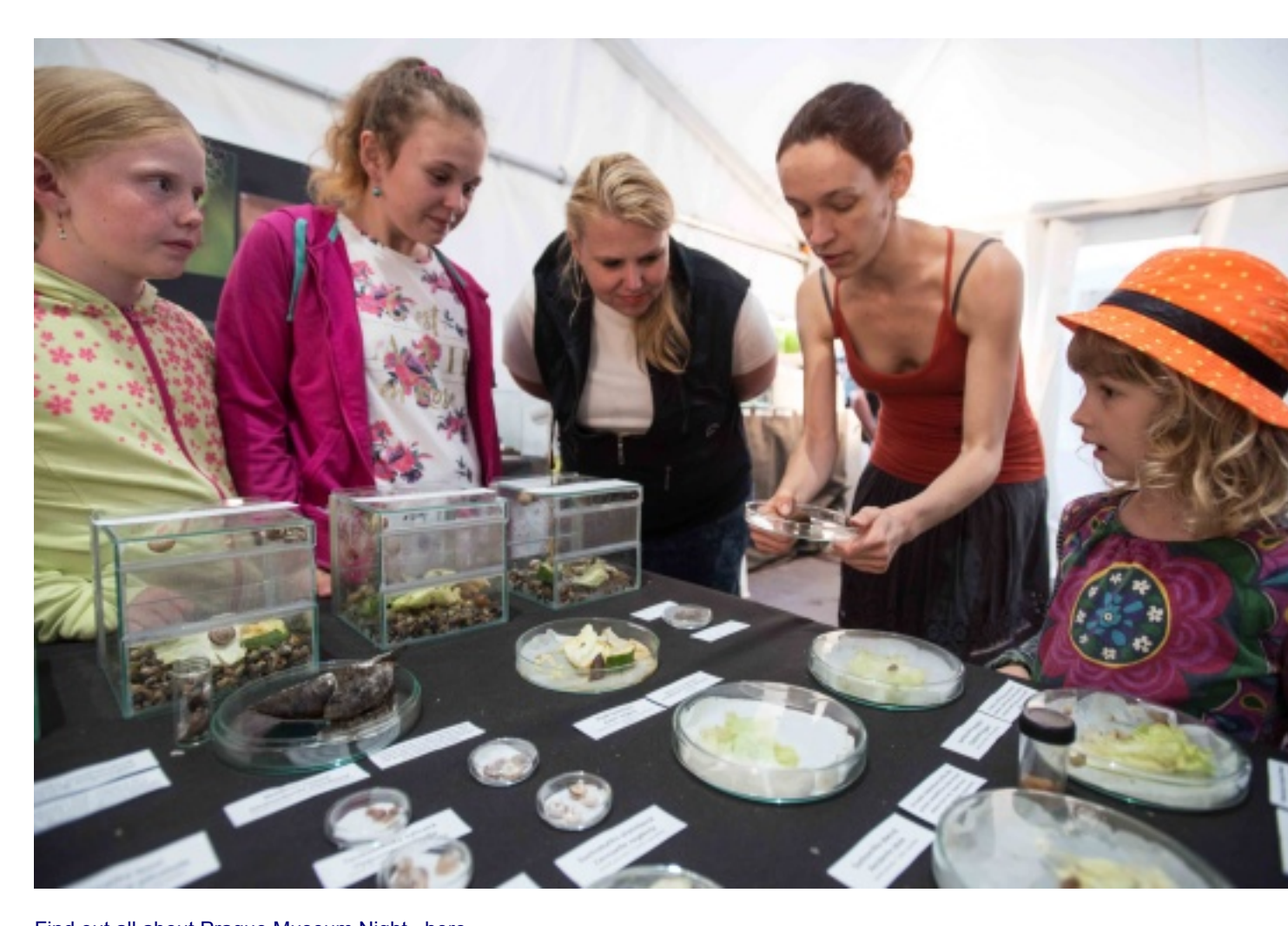
Find out all about Prague Museum Night <a href="here">here</a> and don't forget admission and public transport to and from participating venues is FREE!