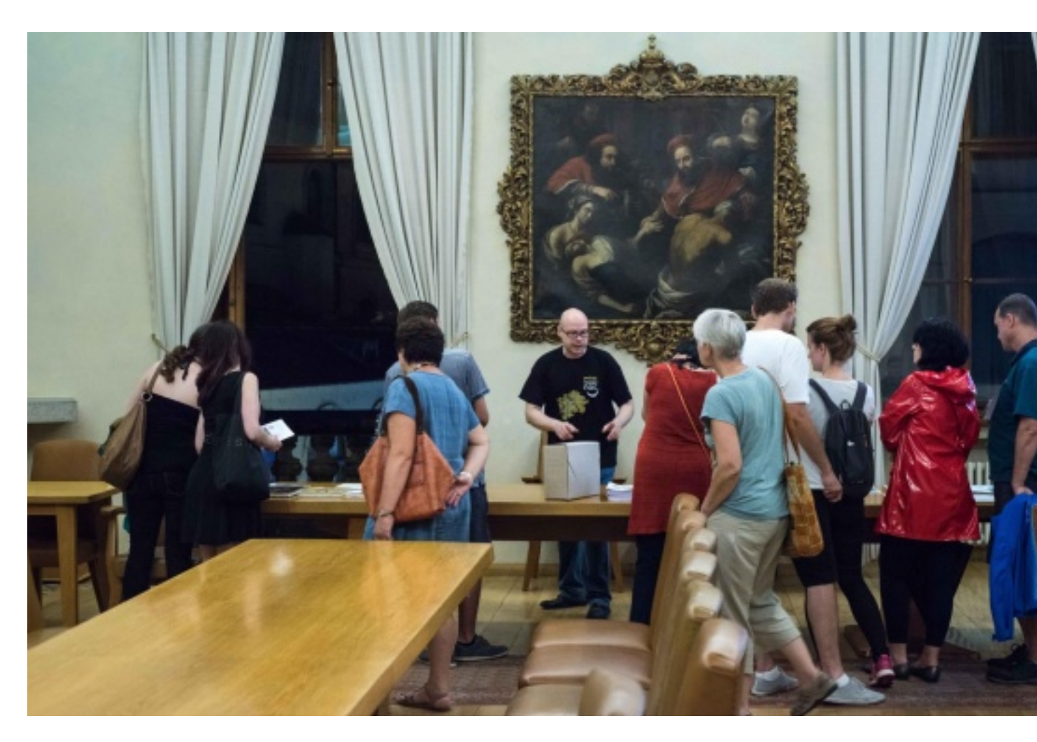
The First Faculty of Medicine's Museum of Human and Comparative anatomy and Museum of Stomatology are taking part as well as is the Academic Club at Faust's House.

The Faculty of Science is inviting attendees to visit its botanical gardens and to take a night tour of its greenhouse facility with its permanent exhibition focusing on flora from the tropics and sub-tropics. Chlupáč's Museum of Earth History, the Mineral Museum, the Hrdlička Museum of Man, will also be open to the public; the faculty's map collection will also be on view. Visitors will do well not to miss the faculty's remarkable interactive periodic table.