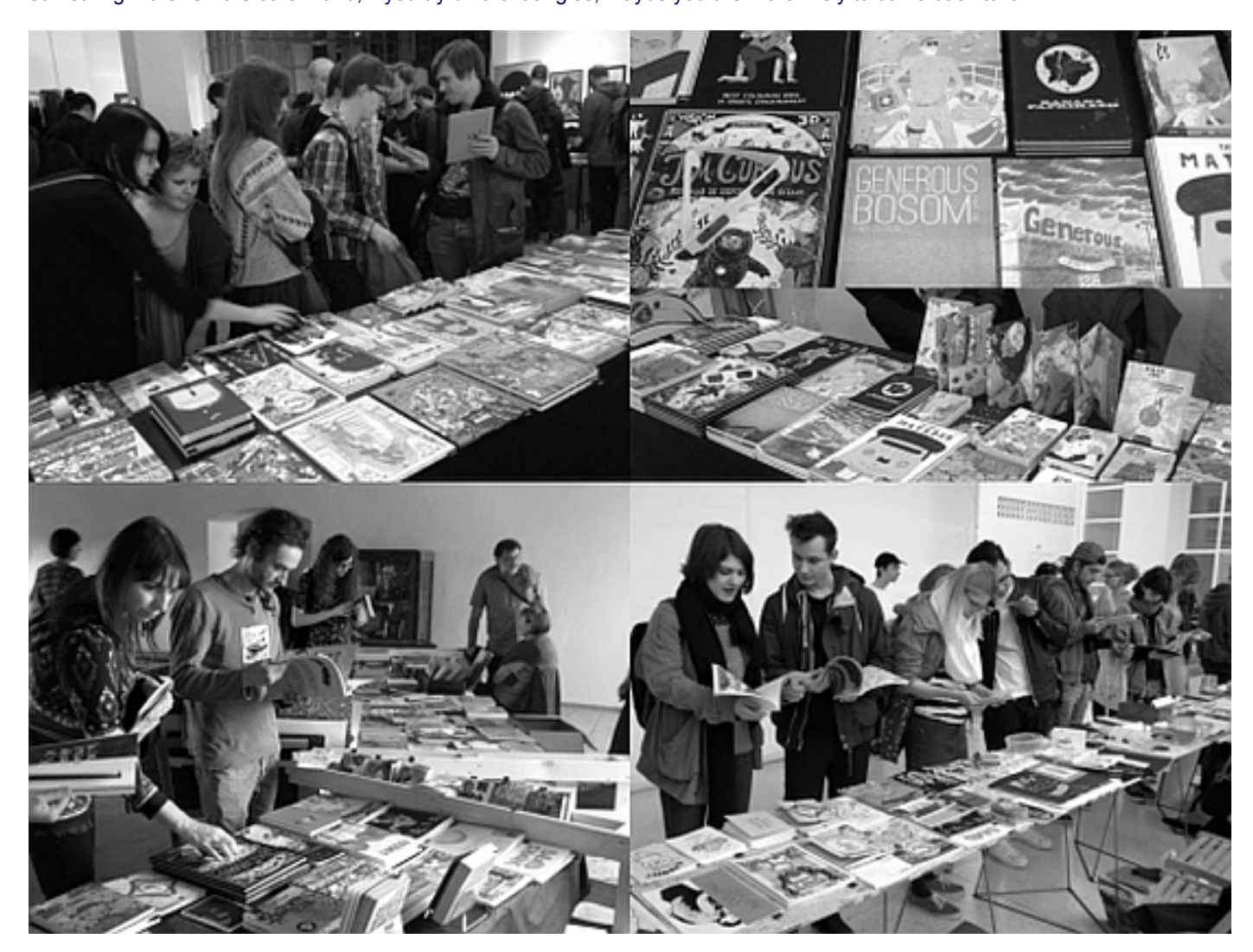
Very quickly and I know its unfair to single out just a few – but who are some of the artists or others who will be here?

"Which comes back to why we are doing this: to offer and promote alternatives to more realistic styles. There is nothing wrong with a realistic or semi-realistic approach like in Marvel or DC and it is nice and requires a lot of skill, there's no doubt about that. But you always get the same thing. Realism or semi-realism: you can't really look at it and try to find something more. On the other hand, if you try different angles, maybe you are more likely to come back to it."