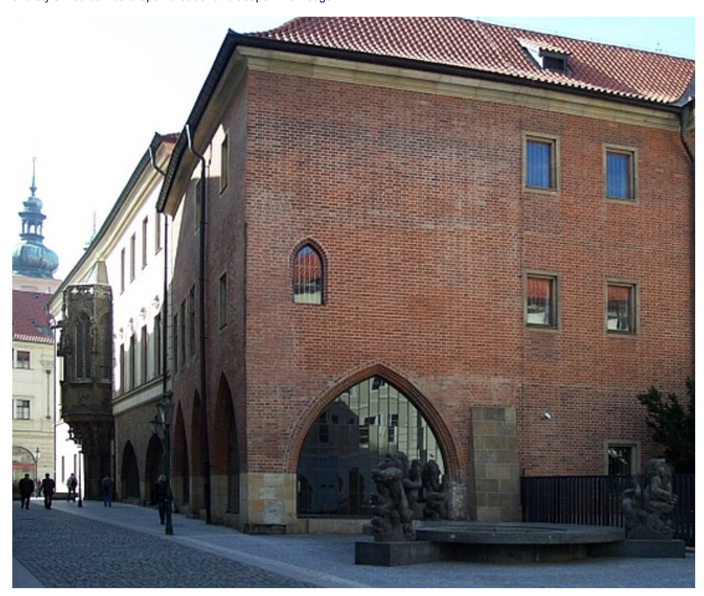
Many Czech publishers now value the worth of comics and the artistry involved and have gotten on board; who are some that will be exhibiting here at the weekend?

"Right now we have a boom of comics movies, which has made it easier to explain what you do. As an author, I can say that every year more and more books are published and they are much more diverse. And they are accessible to order online – you don't have to wait until they are published in your own country. And that enriches your own approach and style. You can build upon broader and deeper knowledge."